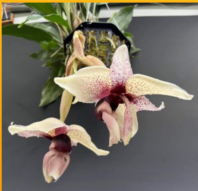
Stanhopea Yoshihiro Urabe (Stan. Michael Bloyer x martiana)