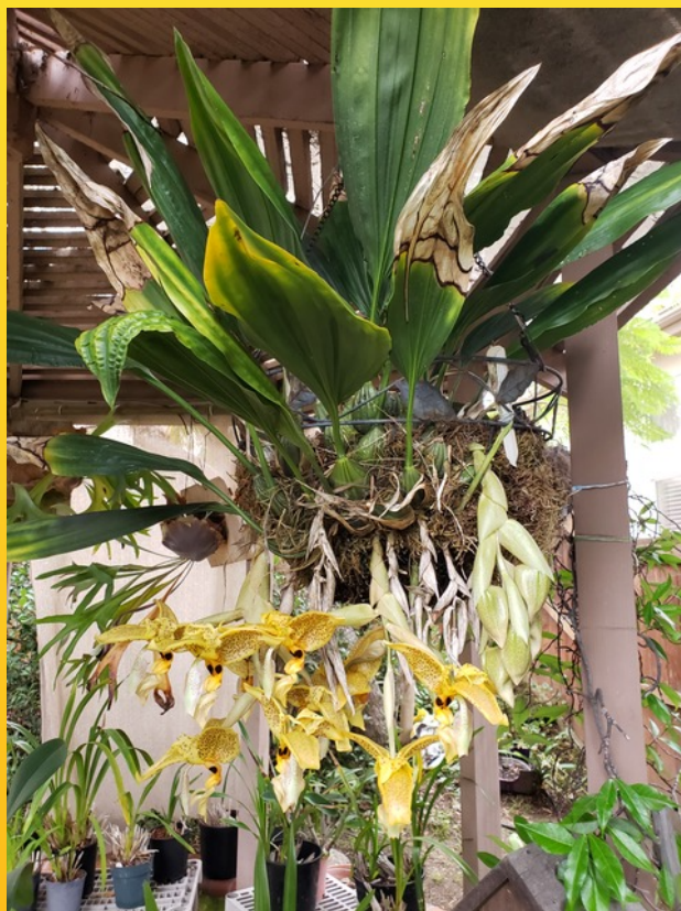
Stanhopea Ronsard (oculata x wardii)