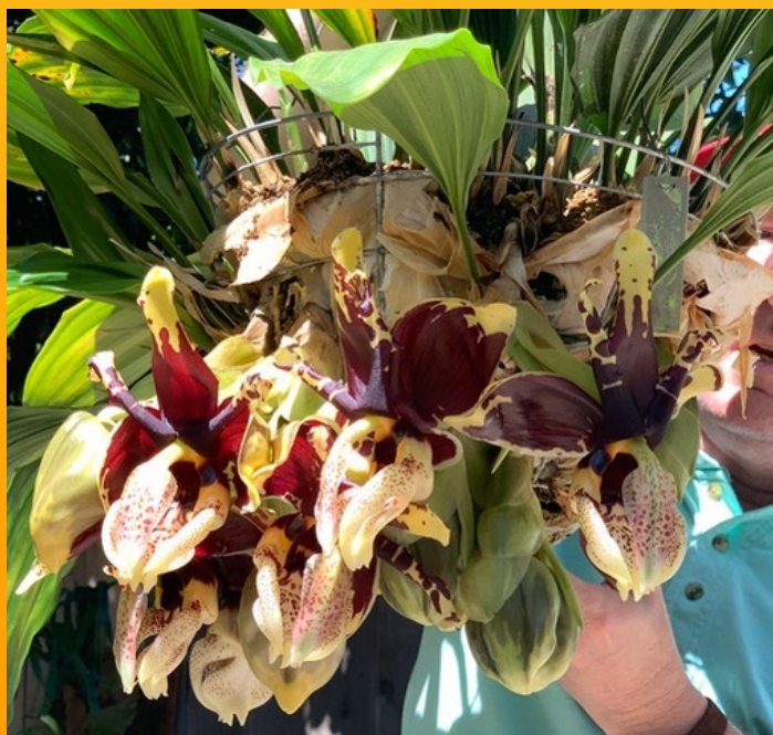
Stanhopea tigrina 'Predato'